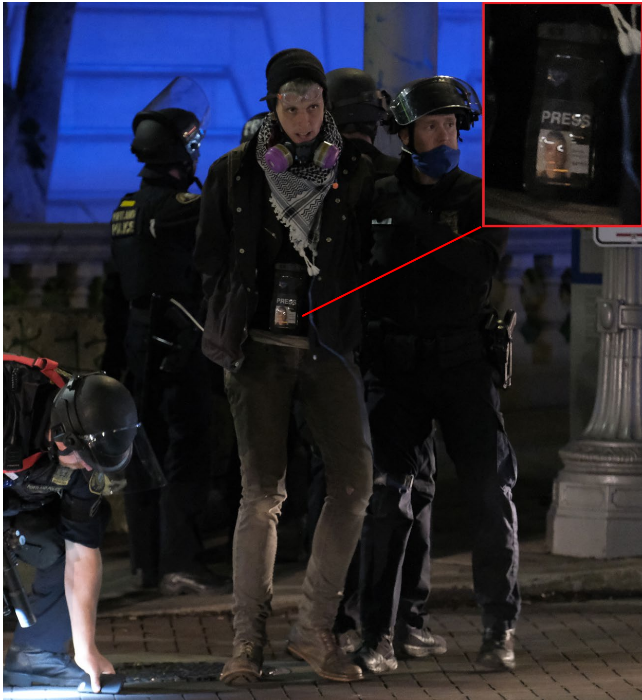
Figure 7: Police arrest a member of the press with his press pass clearly visible.