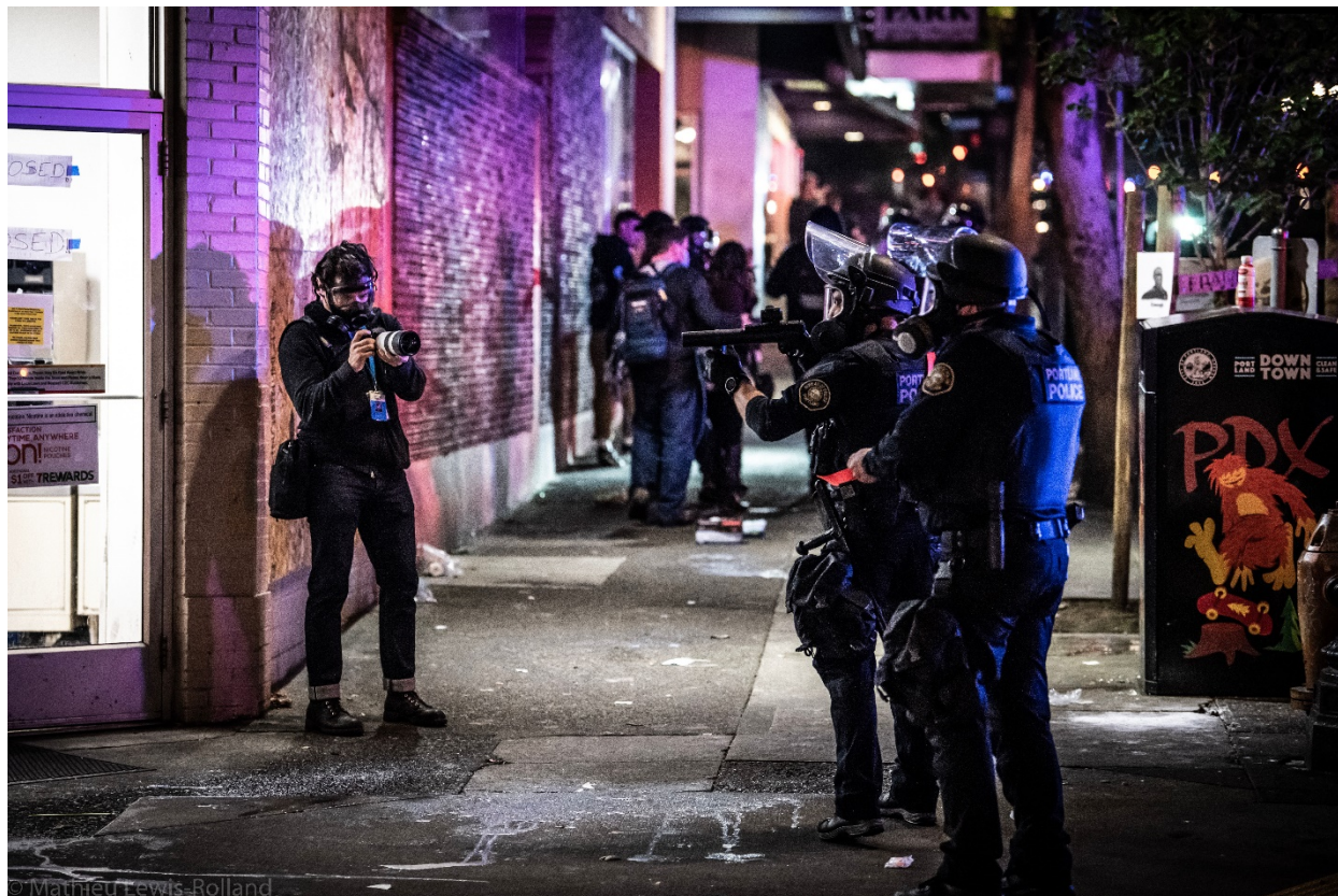
Figure 5: Plaintiff Lewis-Rolland (not pictured) documents a tense interaction between police and peaceful protesters.

71. About an hour later, at the intersection of SW 4th Street and SW Taylor Street, Mr. Lewis-Rolland was documenting a tense interaction between police and protesters: