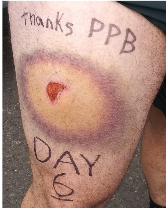
Figure 3: An example of the severe injuries rubber bullets can inflict.

49. Portland police have also deployed multiple types of tear gas, including Agent CS, phenacyl chloride, and oleoresin capsicum. The use of tear gas is banned in warfare. 6 It can cause inflammation, coughing, wheezing, vomiting, blistering, burns, and breathing difficulty or airway closure, especially in people with respiratory conditions. 7 Its use is especially deadly during the current coronavirus pandemic, because it (1) “weaponizes” infected individuals to become “efficient transmitter[s] of infection”; (2) makes those not infected more likely to become infected; and (3) makes coronavirus more deadly to those it infects. 8 Nevertheless, the police used tear gas indiscriminately against protesters nearly every night for the first week of protests and many nights since then.