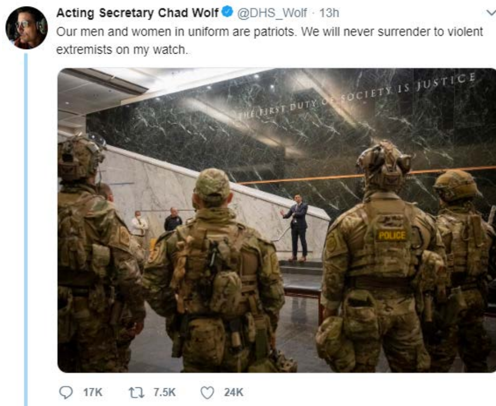
Figure 8: Acting Secretary Wolf's since-deleted Tweet from Portland visit, July 17, 2020.

176. There are no signs that the violence showcased towards Plaintiffs will end. As long as demonstrations persist, and Defendants continue to use the same levels of force, Plaintiffs and other medics will need to administer medical aid. In fact, Acting Secretary Wolf has said on several occasions that the Federal Defendants “will never surrender” and that they “will prevail” against “violent extremists” and “violent anarchists.” See Figures 8 and 9 below.