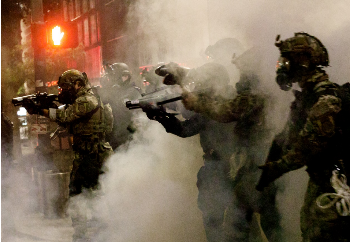
Figure 2: Federal Officers brandish their weapons at protesters, taken by John Rudoff on June 16, 2020.

43. The majority of DHS's and USMS's teams wear either black or camouflage military garb, without clear identification of the agency with which they are associated. There also is no discernible identifying information about the officers. They stand, upon arrival, ready only for combat. (See Figure 2.)