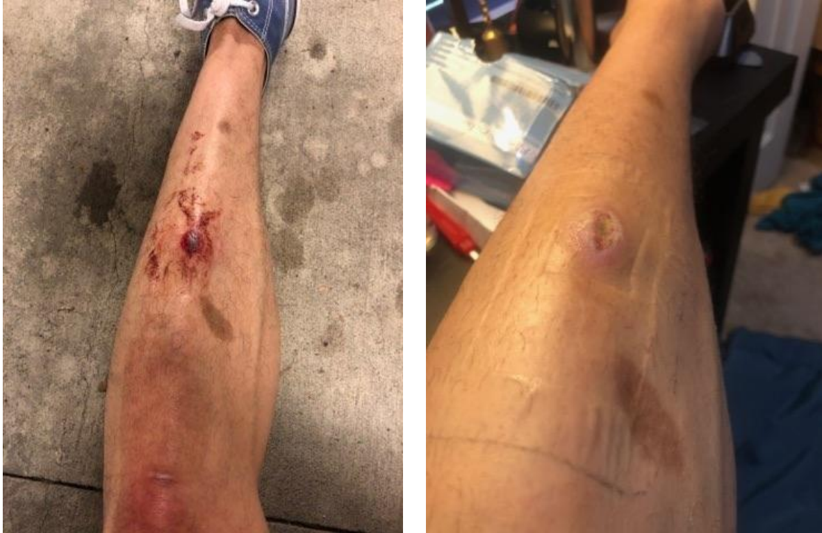
Figure 6: An image of Wise's leg taken immediately after his injury was sustained on June 2, 2020 (left), and an image of Wise's leg taken June 29, 2020 after the resulting infection cleared following a 10-day course of antibiotics (right).

73. Plaintiff Wise cleaned his wound, but it later became infected. He sought medical attention and took a seven-day course of antibiotics. To date, the wound still has not closed, let alone healed.