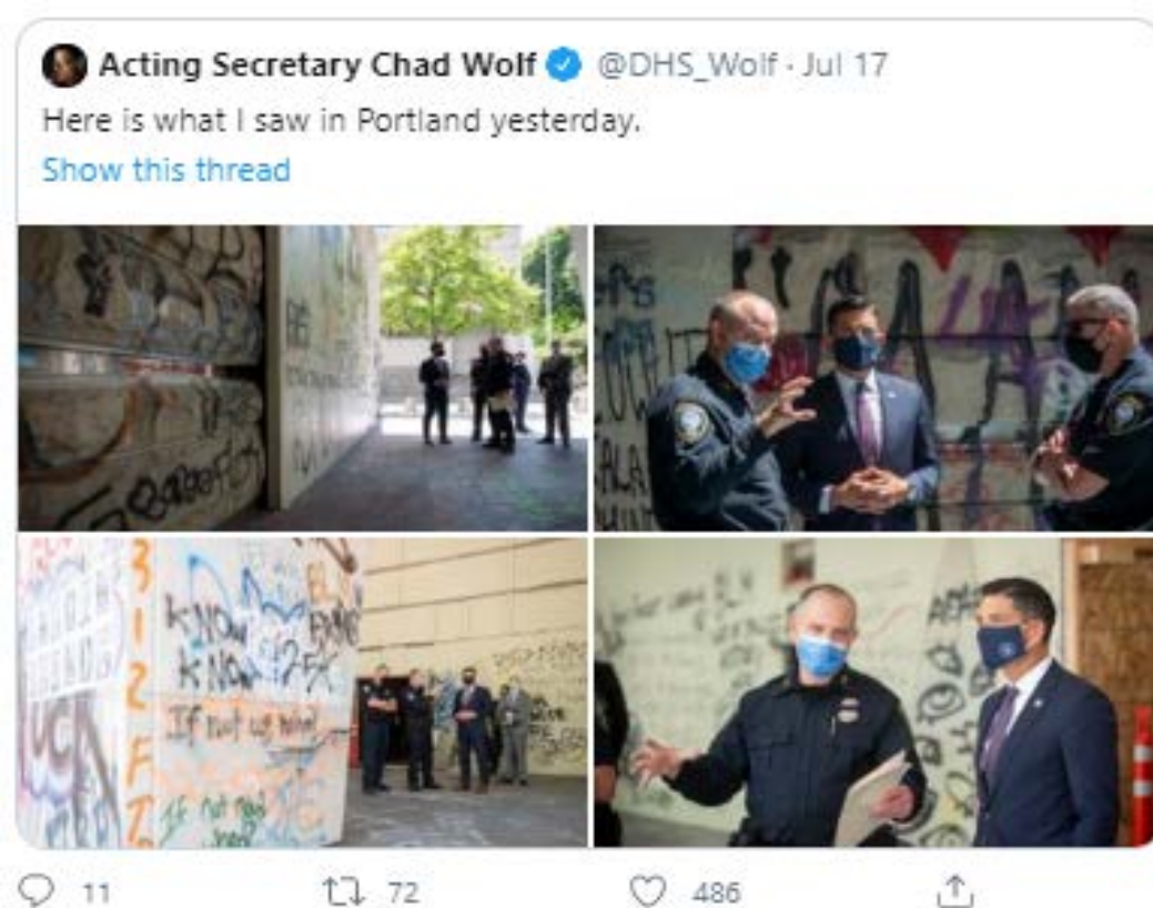
Figure 5: Screenshot of a since-deleted Tweet from Acting Secretary Wolf dated July 17, 2020.

54. Acting Secretary of Homeland Security Chad Wolf has also published the Federal Defendants' supposed rationale for waging war on Portland's citizens protesting widespread police brutality. Those reasons: graffiti, more graffiti, and protesters tossing "animal seed" (pig feed) at riot-gear clad officers. Figure 5 depicts some highlights from the Federal Defendants' justifications. 5