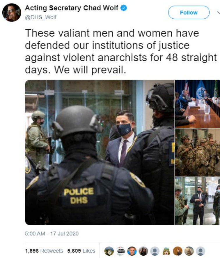
Figure 9: Acting Secretary Wolf's since-deleted Tweet from Portland visit, July 17, 2020.

177. No matter how peaceful the protests are, Defendants will remain in Portland and Plaintiffs will be at risk of injury. President Trump declared that if the protests start[] again, we'll quell it again very easily. It's not hard to do if you know what you're doing." 6 Defendants' use of force has and will continue to cause irreparable harm to Plaintiffs.