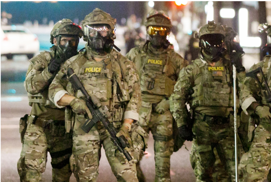
Figure 3: Federal Officer on left is carrying an AR-15 with what appears to be live ammunition.

45. Some also carry AR-15 rifles, stocked with what appears to be live ammunition.