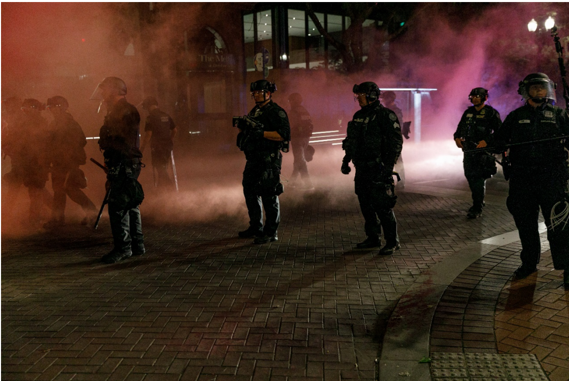
Figure 1: Portland Police officers in riot gear and a cloud of tear gas, taken by John Rudoff on June 19, 2020.

32. For nearly as many nights as the protests have occurred, the Portland Police have responded with outsized displays of force that affect hundreds, and sometimes thousands, of peaceful protesters. Figure 1 depicts the Portland Police, ready to face protesters on a typical night of peaceful protests.