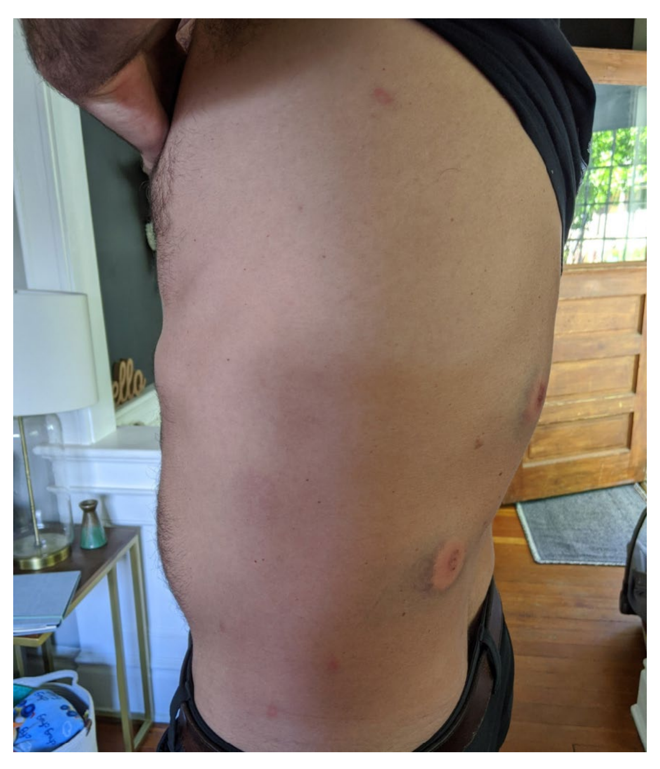
PAGE 7 – DECLARATION OF MATHIEU LEWIS-ROLLAND RE: JULY 12, 2020

16. The following is a true and correct copy of a photograph of my left side, showing two large lacerations on my back and four smaller contusions on my left side: