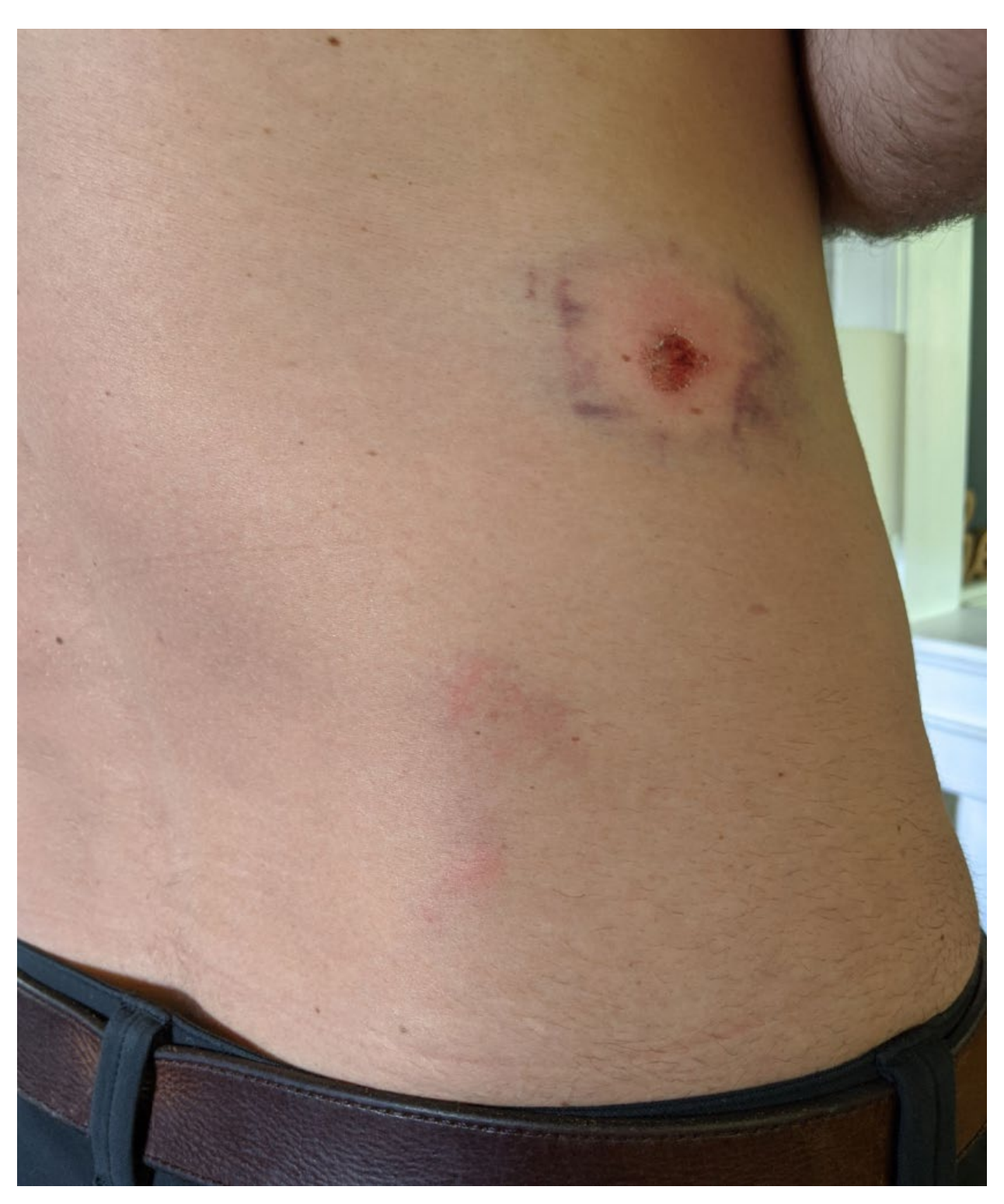
PAGE 5 – DECLARATION OF MATHIEU LEWIS-ROLLAND RE: JULY 12, 2020

14. This is a true and correct copy of a photograph of my right side on the evening of July 12, 2020. It shows one large laceration and two smaller contusions: